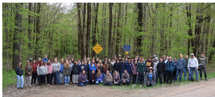
Participants in the Florence Settlement field trip.