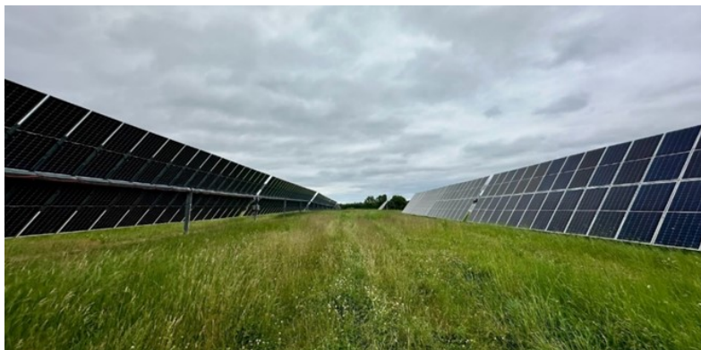
Spacing between rows of solar panels allows for three passes of the tractor.

On the second day, attendees were given the opportunity to tour an agrivoltaic facility located in New Bremen, Lewis County. They heard from Clear Path Energy, the developer of the site, as well as the farmer Myron Zehr, who has been able to continue farming operations including harvesting hay within the panel array. The final day of the training will take place on June 23 to continue expanding upon a variety of topics related to solar development in local communities.