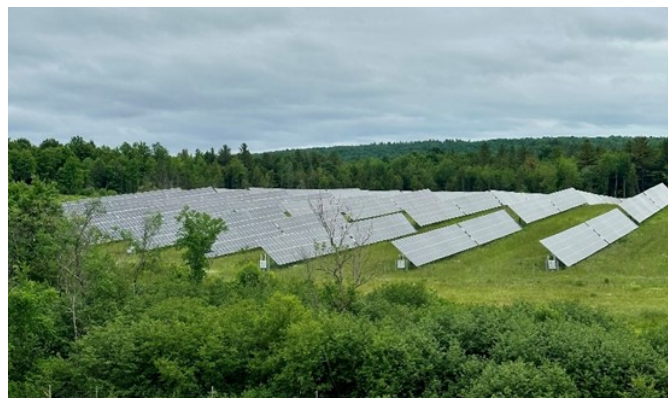
One of two fields where solar panels are installed on the Zehr farm.