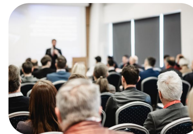
ANNUAL TRAFFIC SAFETY CONFERENCE