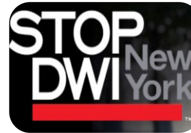
NYS STOP-DWI OVERSIGHT