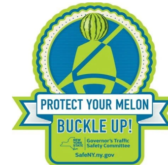
STATEWIDE PUBLIC INFORMATION/EDUCATION INITIATIVES