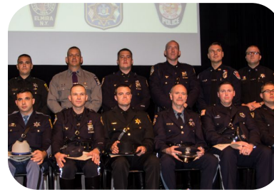
LAW ENFORCEMENT TRAINING