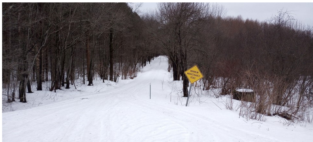
Marsh Road in the town of Lorraine, signed with a NYS Department of Transportation approved minimum maintenance road sign, serves as a NYS-funded snowmobile trail. Snowmobiling is an economic driver in the Tug Hill region, with 866 jobs, over $28.8 million in wages (earnings), and nearly $81.6 million in sales are attributed to snowmobile activity ( tughill.org/reports/ ).