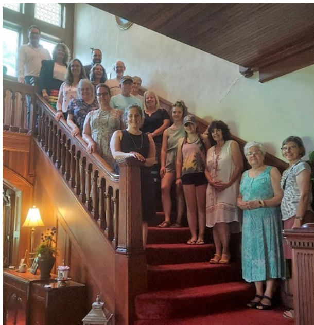
Welcoming reception at Florissante the Mansion.