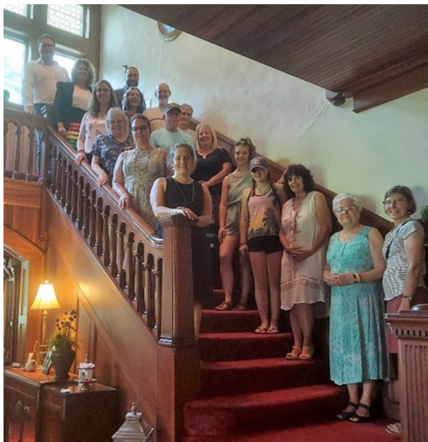
Welcoming reception at Florissante the Mansion.