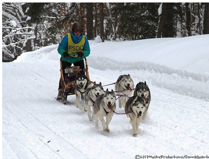
Dog sledding in Winona Forest.