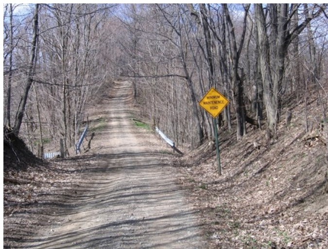
Dodge Road in the town of Lorraine.

land on one or both sides of the road. In 2020, the town's budget was approximately $1.4 million, and 75% of that was spent on highway management. Several town roads in Lorraine provide critical access to the 9,233-acre Winona State Forest: Sharp, Marsh, Brown, Kate Hall, Bishop, Wart, Dodge and Hessel. These roads are unpaved, providing access to the area by motor vehicle in the summer, and access to the area via skis, snowmobiles, dog sleds, snowshoes and fat