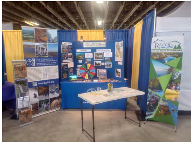
The full display at the Lewis County Fair.