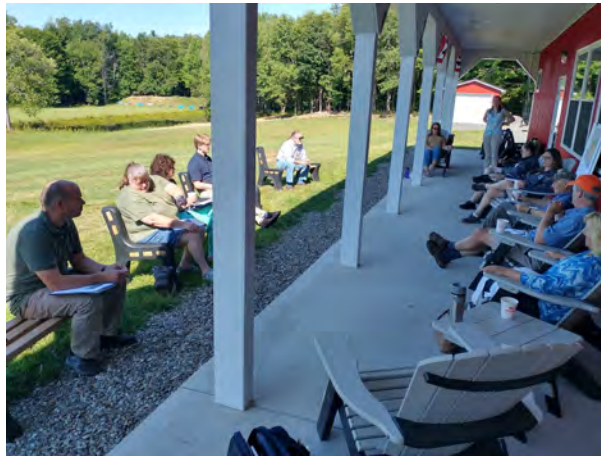
Relaxing at the Osceola Ski and Sport Resort.

The group also discussed upcoming 2023 activities, including the Tug Hill Commission's 50th anniversary, and played a rousing game of Tug Hill Jeopardy.