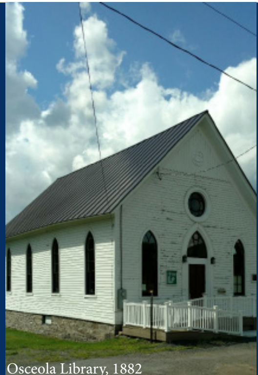
Osceola Library, 1882

The Tug Hill Commission's Technical Papers and Issue Papers are written to help local officials and citizens in the Tug Hill region and other rural parts of New York State. Technical papers provide guidance on procedures based on questions frequently received by the commission. Issue papers provide background on key issues facing the region without taking advocacy positions. Other papers are available from the Tug Hill Commission. Please call us or visit our website for more information.