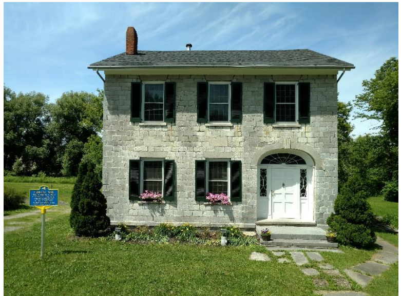
The Hubbard House, Champion, 1820

When it comes time to begin actual physical work on structures, a number of grant programs exist to help offset costs (see table below). It should be realized, however, that such funding programs typically are tied to strict rules and provisions regarding the nature of the work involved.