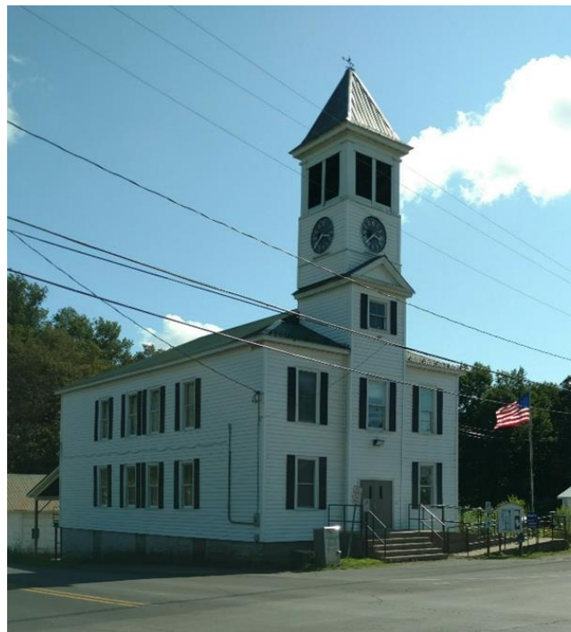
Orwell Town Hall, 1906-1909