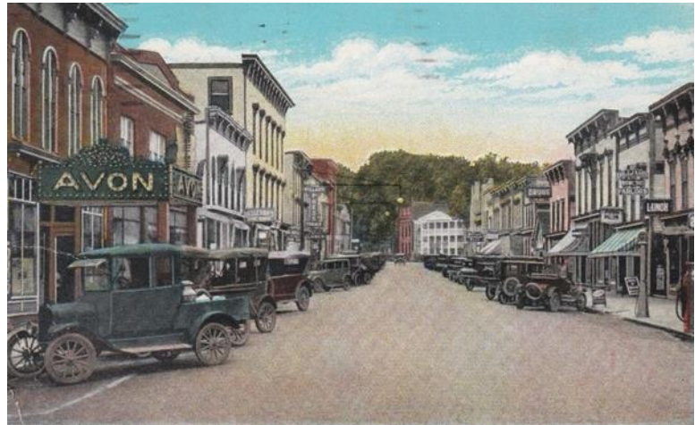
Postcard of Boonville Historic District

Importantly, those jobs have paychecks, and because the jobs are usually local, the workers who get those paychecks spend the vast majority of their income locally as well.”