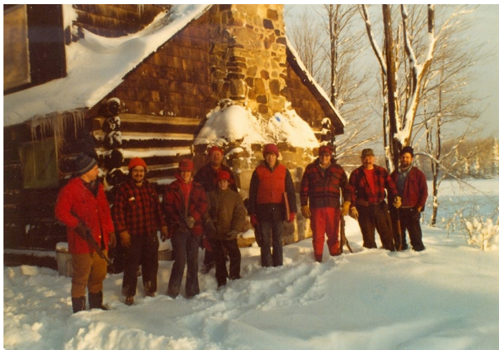
The 1977 Deer Hunting Crew at Brandy Brook Sports Club.