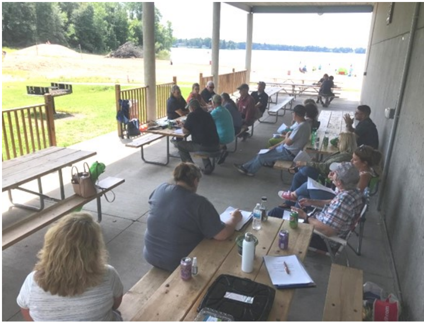
Board members and staff enjoy Delta Lake State Park.