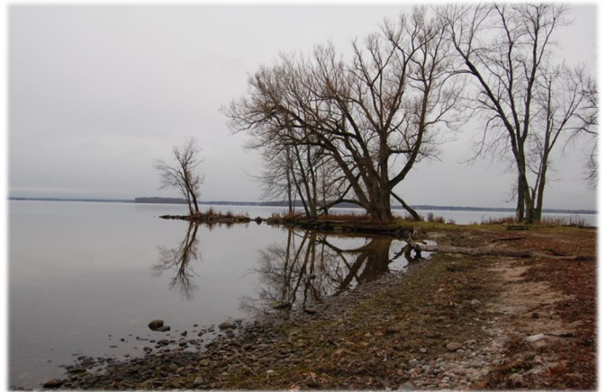
View of Oneida Lake from Three Mile Bay WMA.

More information is available at www.dec.ny.gov/outdoor/70681.html .