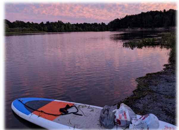
Black River at Marble Street Boat Launch, Watertown.