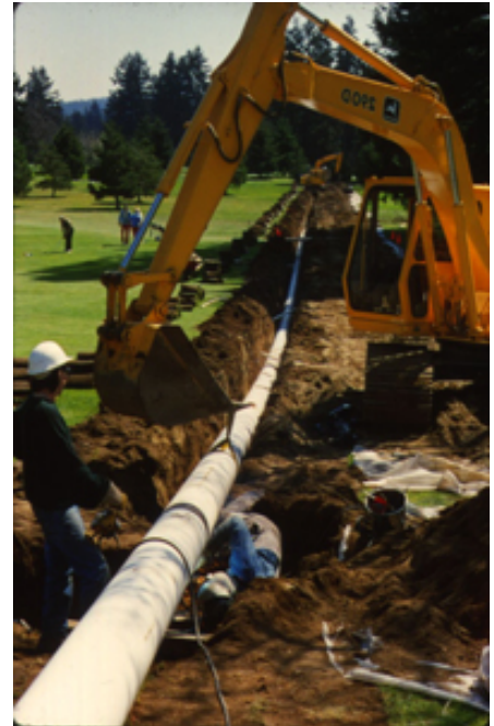
Installing a small diameter distribution pipe

It is very important that a landowner have an attorney familiar with gas and oil leasing review any lease presented to them before entering into any leasing agreement in order to make sure that the landowner’s rights and interests are protected adequately.