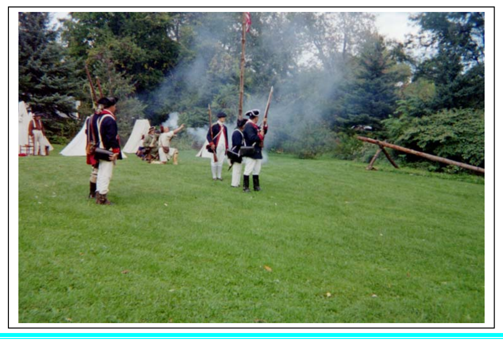
Black River Trail Scenic Byway Corridor Management Plan

The history of the Black River Canal, and of the communities that formed along it, offers a unique traveling experience with a wide array of significant sites and events that highlight this heritage. Historical resources along the travel route include art, archeological sites, cemeteries, churches, community centers, festival/fair grounds, historic architecture, monuments, museums and theaters. Forty-eight historical resources were identified and catalogued as part of the Black River Blueway Trail Development Plan . Those sites and resources that uphold the Black River Trail Scenic Byway theme and are operated by non profits or are free to the public have been entered in the Resource Key and appear on the Byway route map.