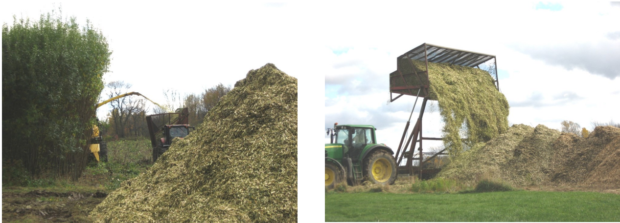
Above are pictures of willow harvesting at the Agen Farm in Ava.

Several Tug Hill Commission staff and commissioners participated in the tours, marking the first National Bioenergy Day that offered an opportunity to educate the public about the value of bioenergy powered by wood and agricultural crops in terms of environmental sustainability and renewable jobs and revenues for rural economies.