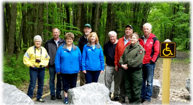
Representatives from the Adirondack Mountain Club Black River Chapter, NYS Department of Environmental Conservation, and the Northern Regional Center for Independent Living attend ribbon cutting at Inman Gulf.

DEC Region 6 held a ribbon cutting ceremony for the newly accessible John Young Trail on Friday June 2. The trail recently underwent construction to improve accessibility for visitors with mobility issues and families with children in strollers. The trail is located within the Tug Hill State Forest at Barnes Corners and is approximately 2,000 feet long. The DEC plans to extend the trail approximately 500 feet in the future.