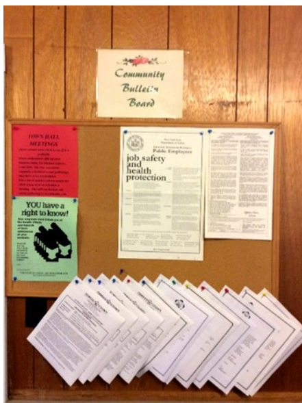
Town of Boylston's "Community Bulletin Board" and "Town Clerks Official Bulletin Board"

Electronic versions appear in full color!